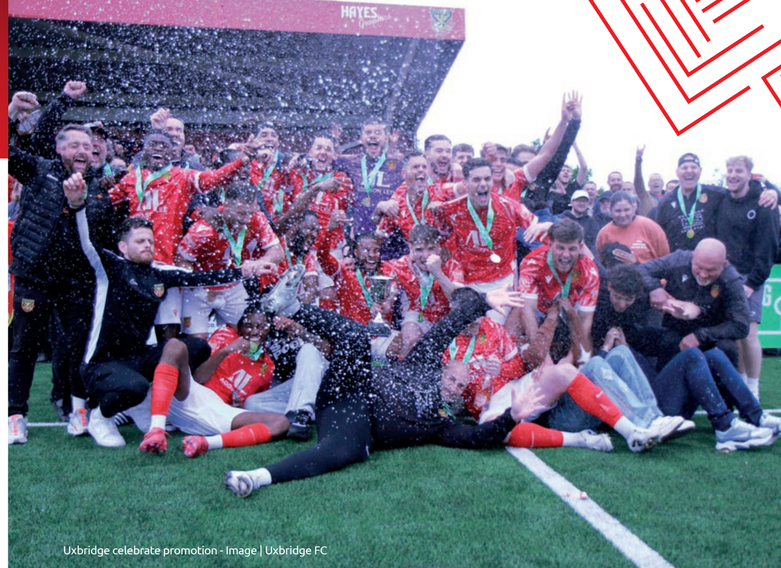
Uxbridge celebrate promotion - Image | Uxbridge FC

"The first challenge is a tough one as Dorchester Town are well-established at this level and are sure to challenge amongst the leading pack again. It will be a good early gauge for us."