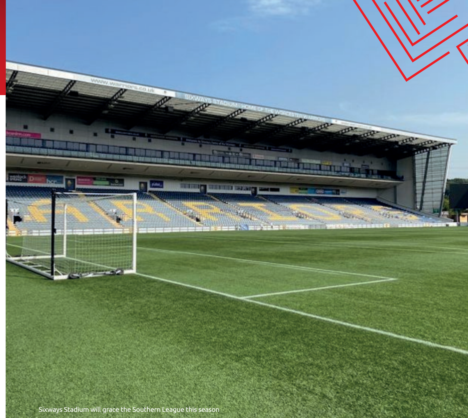
Sixways Stadium will grace the Southern League this season

"I want us to be competitive; I believe with the squad we have, we should be, so what position or where that takes us I'm not sure as you can only control your team and your efforts. But after last season, I certainly want to see us give the supporters something to be happy about and for them to see a competitive team that is giving it a right go."