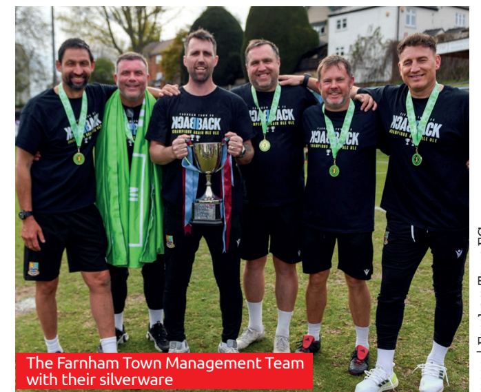
The Farnham Town Management Team with their silverware

Two teams whose battle against the drop went down to the last day, Tiverton Town and Chertsey Town, lock horns in Devon, whilst Walton & Hersham, who claimed third place last time out, welcome Plymouth Parkway. There's a meeting of two sides who were two levels apart last season as Weymouth, relegated from The National League South, host Division One South play-off winners, Evesham United.