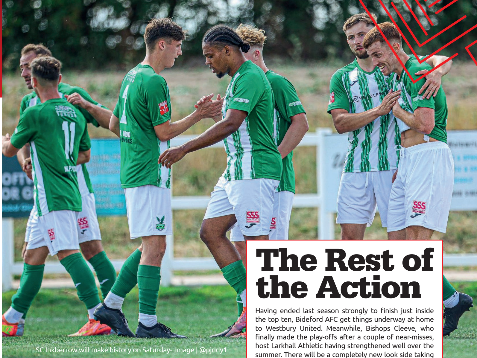
SC Inkberrow will make history on Saturday