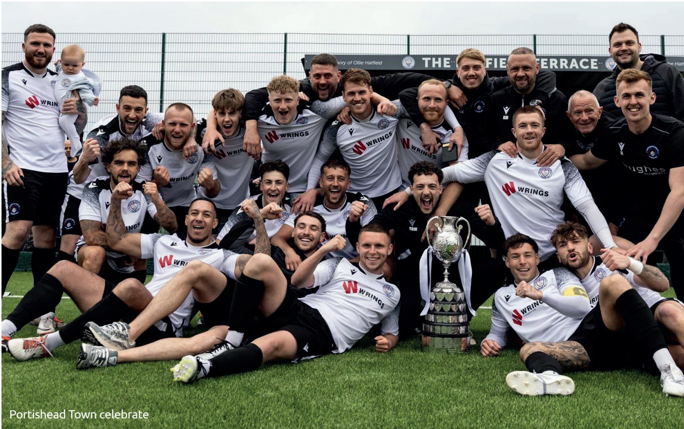
Portishead Town celebrate

"We want to be pushing for a third straight promotion. As I say,